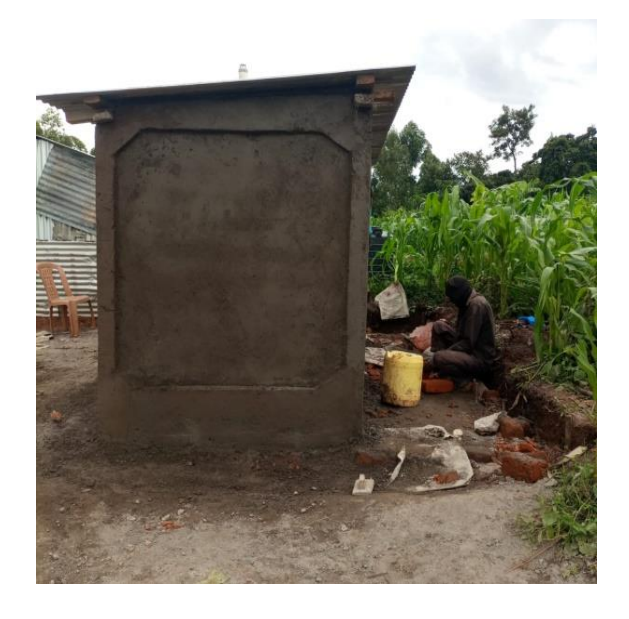
New Latrine with brick walls and stucco overlay