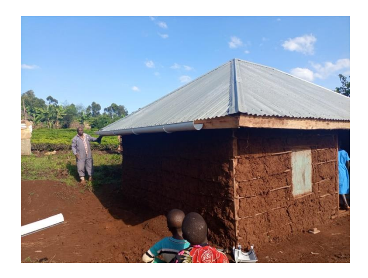
Gravity Feed with Water Tank on Pastor Erick's Home