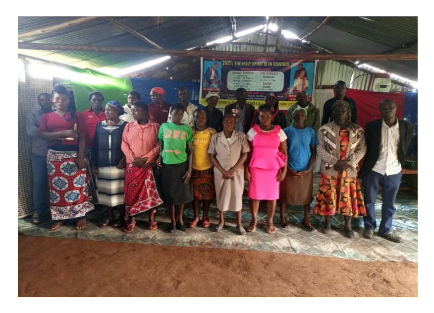
Baptisms in Kenya