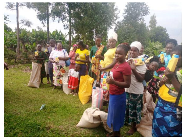
Gifts of Oil for Mothers in Kenya