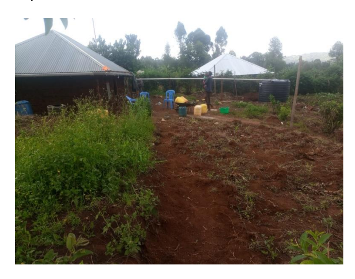
Rain Gutterrs on the Church – Big Rains January – March Little Rains October – December