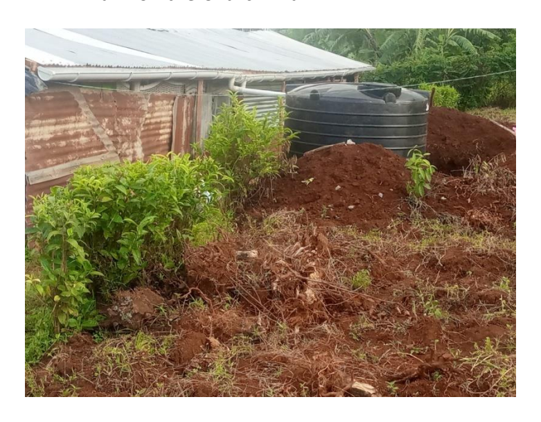
New Wall along the Church with Water Tank