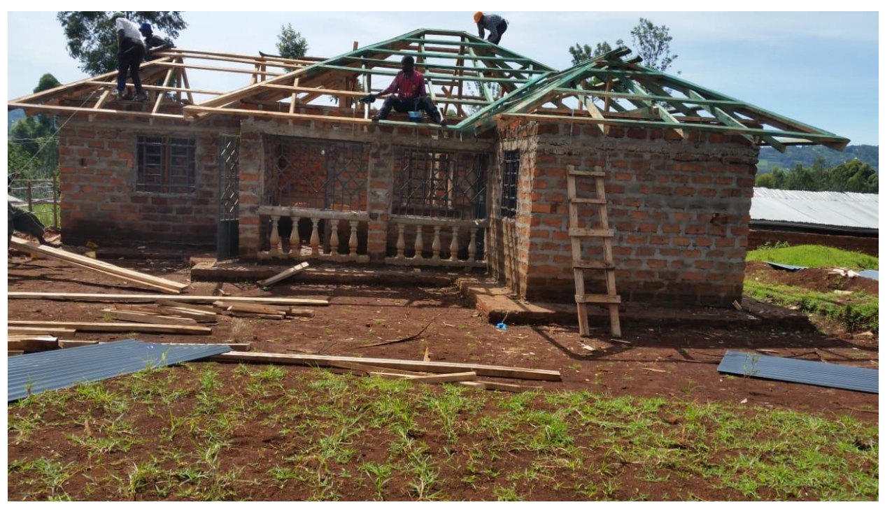
Rafters to support a new metal roof that will eventually carry rain gutters for water tank

We were able to include metal frame windows and real doors!