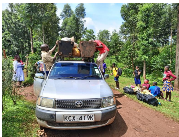
The crusade was a blessing and wonderful success!