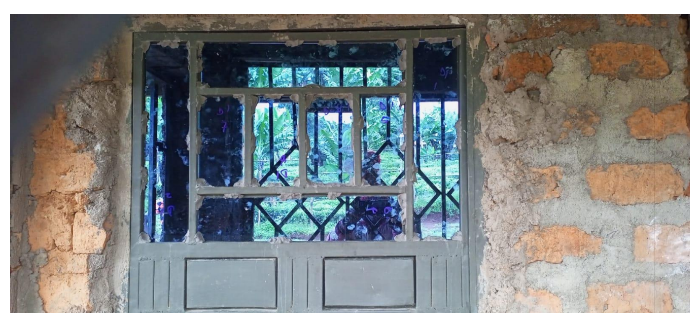
An exciting entryway with stucco walls