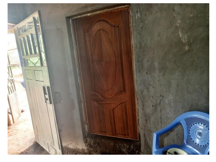
With New interior Doors