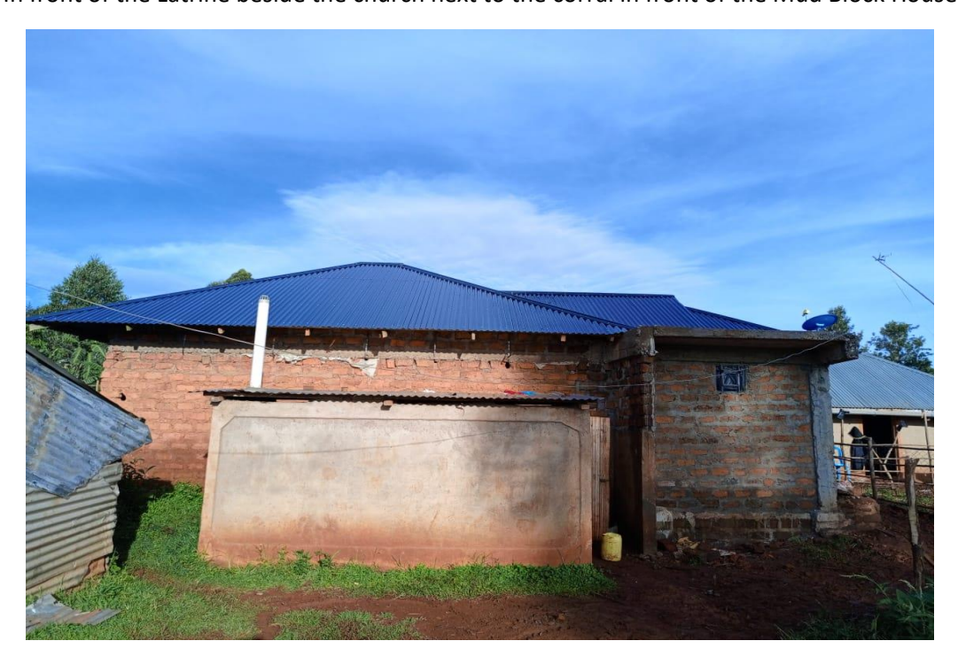
Here is a picture of the whole compound with the Church, New House and Mud Block House...Notice bricks going up alongside of the church building. A good use of left over bricks. Our next goal.

In front of the Latrine beside the church next to the corral in front of the Mud Block House